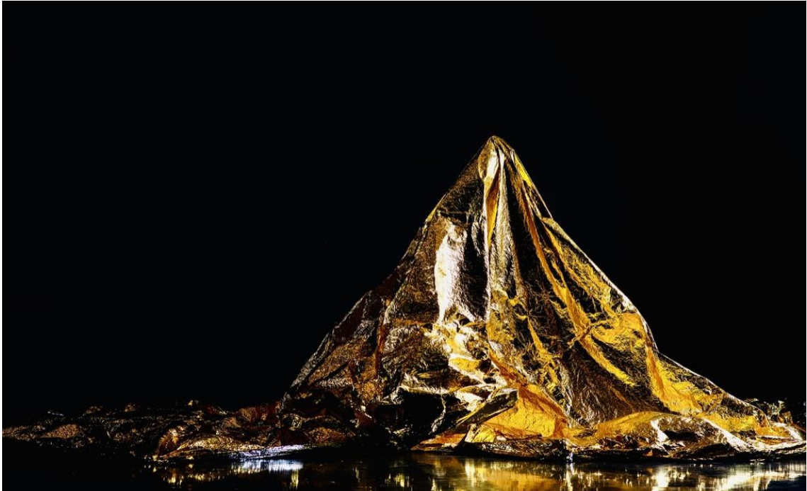
Figure 3 Foil also known as space blanket and emergency blanket.